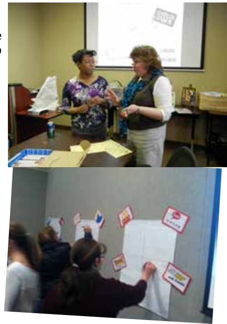
Teachers are engaged in active learning of lessons and complimentary hands-on activities easily implemented in the classroom.

Thursday, May 15: 3:30-4:30 p.m. Monday, May 19: 3:30-4:30 p.m. Wednesday, June 11: 10:00-11:00 a.m.