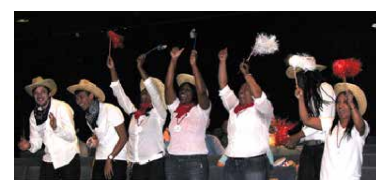
That's the Elizabeth Mason Spirit: First Financial Bank cheers on its team.