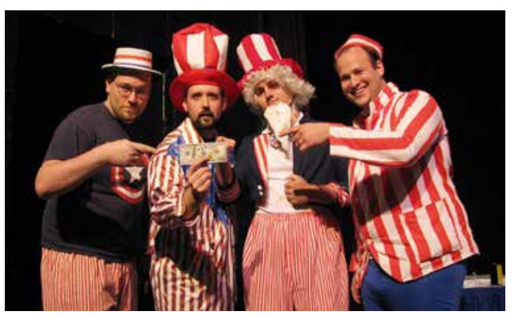
Team Uncle Sam from Nexans AmerCable wins the prize for best costume.