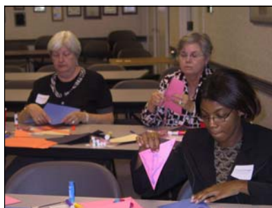
Union County teachers learn to "Discover the Magic of Economics in Children's Literature"!

The ACEE received a grant from the Union County Community Foundation to offer a Children's Literature workshop in Union County. The workshop was held September 28 at Simmons First National Bank in El Dorado. Nine educators learned to identify economic concepts in children's literature books and activities to reinforce the learning. Each teacher received a curriculum guide, a children's literature book and three hours of staff development for attending. Many thanks to Union County Community Foundation for their support!