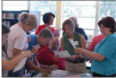
Sacred Heart teachers participate in a financial literacy activity.

Contact the ACEE at 501-682-4230 to learn more about Financial Fitness for Life !