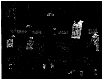
forming interdependence web