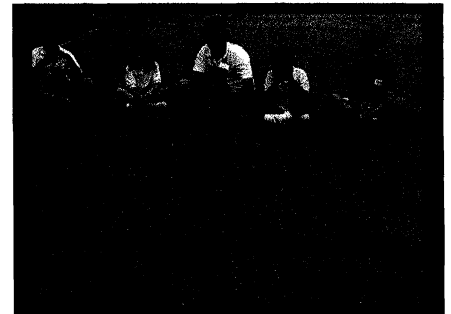
Understanding the importance of interdependence