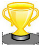
Fort Smith Trivia Grand Champions